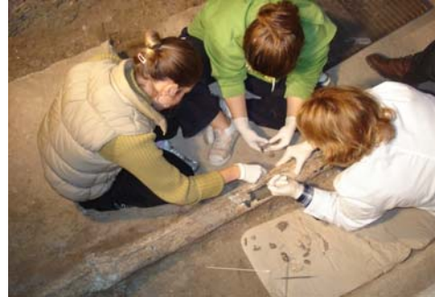
Fig. 2 Conservation work in progress