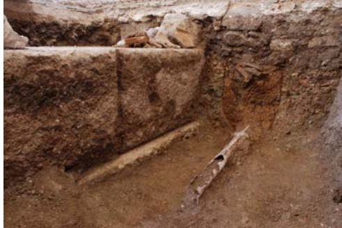
Fig. 1 Aeolus excavation, A'EPKA. Lead pipe and the outer side of the south wall of the Library of Hadrian, view from west

In conclusion it should be emphasized that the analytical study will allow us to make decisions on the need for the inhibition of corrosion and on the appropriate methods for stabilizing and thus securing the preservation condition of the lead pipe.