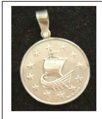
Fig. 1 Silver medaillon coated with Paraloid B72 added with 2% Al 2 O 3 nano-pigments after 1 year exposure to the atmosphere

The plasma treatment has been carried out on copper and silver based alloys,