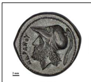
Fig. 1 Counterfeited Adriano's coin

The problem of counterfeit of works of art occupies a central place in the management of Cultural Heritage for its implications on art history and for the legal implications that derive from the origin and trade of artefacts. The relevant international trade in art works, through auction houses and antiquarians, requires, in order to protect both buyers and sellers, an objective survey to certify the authenticity of the objects. The problem is very sensitive in the field of metal artifacts, with special attention to jewelry and coins, the latter representing a particularly fruitful investment for forgers. The assessment of the originality of an artefact is made, in most cases, by means of macroscopic analysis based on experts advices, while the collection of micromorphological, microchemical and microstructural data may help in defining a sort of fingerprint of the artefact and may help in distinguish between